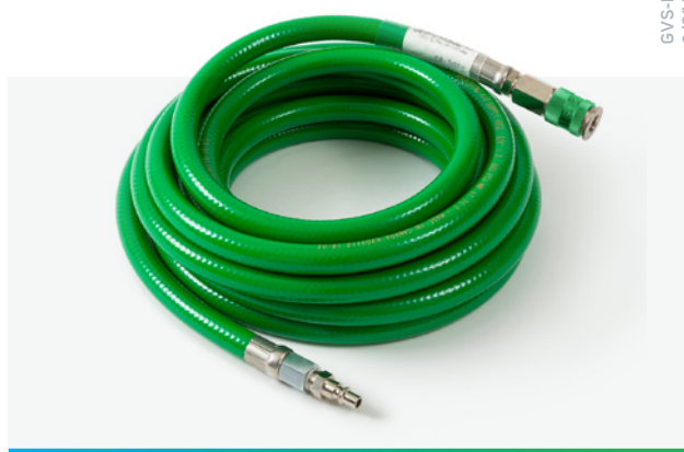
GVS-RPB Breathing Air Supply Hose 3/8" Diameter

They wanted that, so if they go onto a worksite and they see a black airline hose, they know that someone's not compliant.