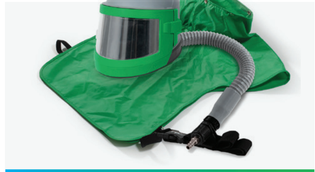
Nova3® Blast Respirator with Flow Control Valve

“Employees love the comfort. No one likes to be in a sandblast hood all day, so one that's more comfortable is a no brainer.”