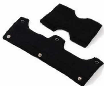
Comfort Padding (Sweat Band and Neck Pad) Part # 13-043