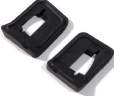
Outer Lens Frame Seals Part # 13-051