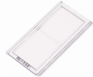
Ultra Rear Lens (pk 10, 3.78" x 2.68" / 107mm x 71.5mm) Part # 13-054