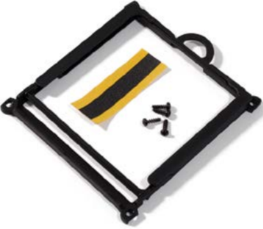
Magnifying Lens Holder Part # 13-071