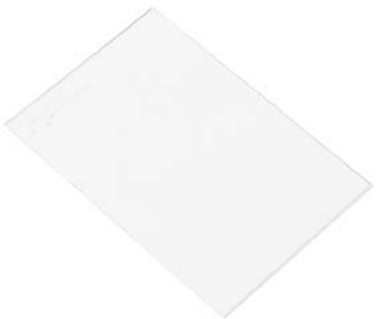
Ultra Rear Lens (pk 10, 3.78" x 2.68" / 107mm x 71.5mm) Part # 13-054