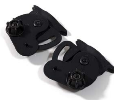
Hard Hat Adapter Clips Part # 13-045