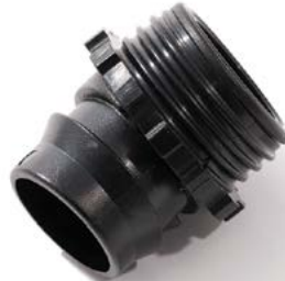
Swivel Air Fitting Elbow Part # 03-032