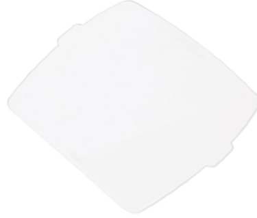
Impact Lens (pk 10) Part # 13-052