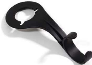
Hose Holder Part # 13-041